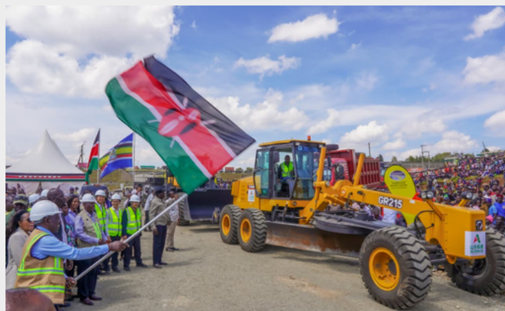
H.E. President William Ruto flags off construction works at the third site of the A8 Road at Mau Summit, Kericho County, on 28th November 2025.