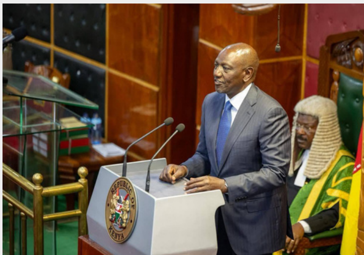
H.E. President William Ruto delivers the State of the Nation Address at Parliament on 20th November 2025

In his State of the Nation Address on 20 th November, 2025, H.E. President William Ruto, outlined an ambitious national roads and transport programme.