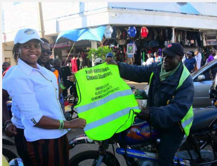
Road Sub-Sector officer distributes hand over a reflector jacket to a bodaboda rider during the WDoR 2025 outreach in Eldoret town on 23 rd November, 2025.

Senior officials from the State Department for Roads led the multi-agency delegation, joined by teams from the Kenya National Highways Authority (KeNHA), National Transport and Safety Authority (NTSA), Kenya Rural Roads Authority (KeRRA), Kenya Urban Roads Authority (KURA), NACADA, Moi Teaching and Referral Hospital, and other key partners in road safety.