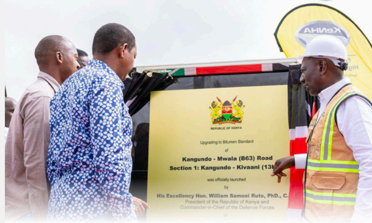
KBC NEWS President William Ruto launches the construction of the Kangundo-Mwala Road in Kanaundo, Machakos County