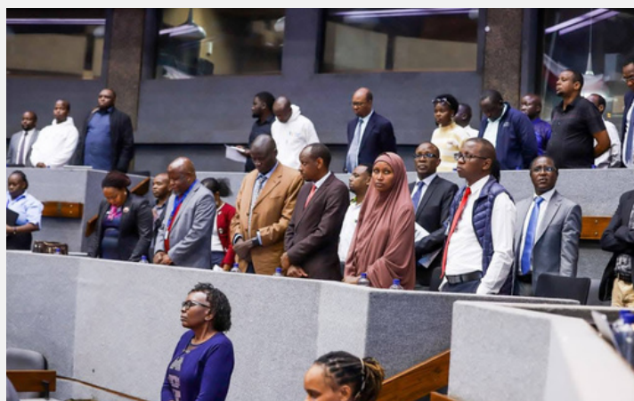
A section of participants during the Energy, Infrastructure and ICT public sector hearings on the Proposed FY 2026/27 and Medium-Term Budget at the KICC on 19th November 2025.

The proposed budget presentation hearings provided a platform for public participation, ensuring citizens have a voice in national planning and resource allocation.