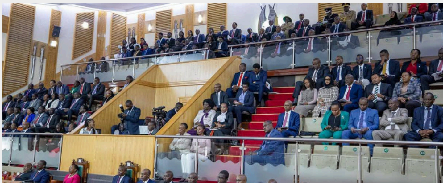
A section of Cabinet Secretaries and Principal Secretaries keenly follows the State of the Nation Address by H.E. President William Ruto at Parliament on 20th November 2025.

Additionally, he announced plans to extend the Standard Gauge Railway from Naivasha to Kisumu and later to Malaba starting January 2026 to strengthen regional trade links.