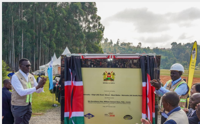
H.E. President William Ruto and Cabinet Secretary Davis Chirchir applaud during the unveiling of the project plaque at the A8 road construction launch on 28th November 2025.

The initiative aligns with Vision 2030 and the Bottom-Up Economic Transformation Agenda (BETA), reinforcing the government's commitment to inclusive growth, rural development and social integration. The project is expected to create an estimated 10,000 jobs, prioritising youth employment, skills transfer and local procurement of labour and materials.