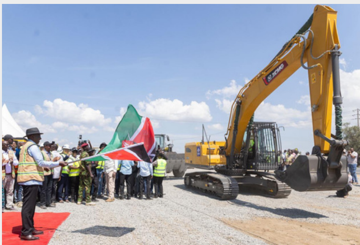
H.E. President William Ruto flags off construction works at the second site of the A8 Road at Gilgil, Nakuru County, on 28th November 2025.